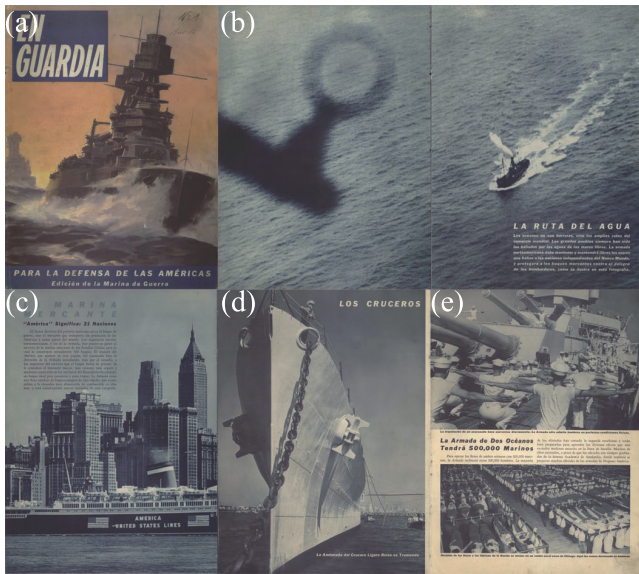
Figure 2: Some pages of the En Guardia magazine. Figure 2(b) covers two pages.

tactics). First, the large font size associated with the title and the subtitle as well as the oversimplifying language in them signal the use of the Binary Reduction tactic, which employs the false-dilemma logical fallacy. Second, the use of language to depict that the Americans are superior in many ways (e.g., “Our higher standard of living”, “for all the superiority of our American highways”, etc.) signals the All-encompassing tactic, which is a sort of rhetoric that often appears as window dressing for a larger point. Third, the sentence “America has the advantage of maximum efficiency and economy” employs the Cultural Signaling tactic, calling on America’s values of efficiency and success. Finally, the text gives “best estimates” of the USSR’s road network, which is a case of the Card Stacking device, where only partial facts are used to defend a statement.