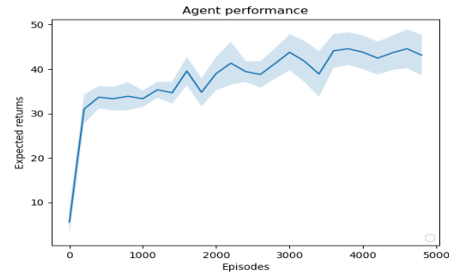
Figure 1: Expected returns

The current phase of this research focused on the modeling and development of a reinforcement learning environment where decision agents can be interfaced and trained to learn operational strategies during a pandemic for different educational campus models. For the future, we would like to incorporate epidemic spread models situated indoor rooms (such as in (Hekmati et al. 2021)).