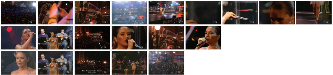
Figure 3: Summary produced by method of Gong et al. (2014) (top row), vs. STREAMING LOCAL SEARCH (middle row), and a user selected summary (bottom row), for YouTube video 105.

are competitive to the two centralized baselines.