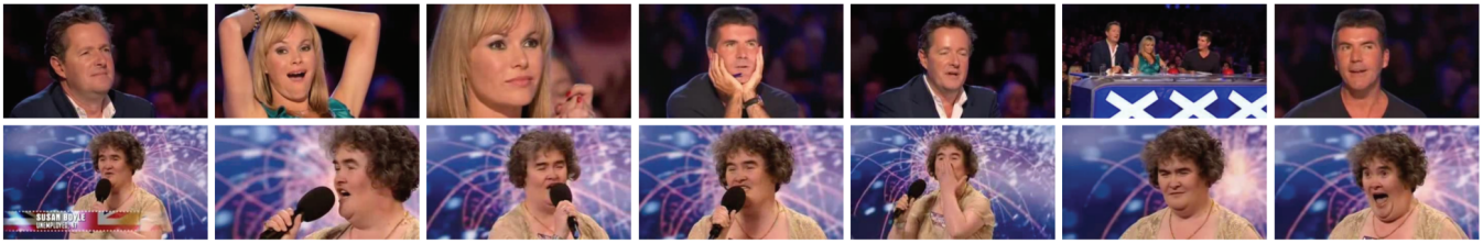
Figure 2: Summary produced by STREAMING LOCAL SEARCH, focused on judges and singer for YouTube video 106.