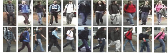
Figure 1: Typical examples of person verification across cameras. Each column corresponds to one individual, and the large variations exist between the two examples due to the light, pose and view point changes.

capturing variety of image appearance and handling complicated nonlinear manifold.