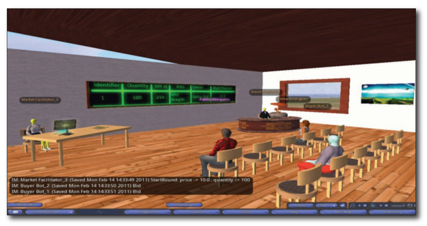
Figure 3. Scene of a Virtual Auction House Electronic Institution.