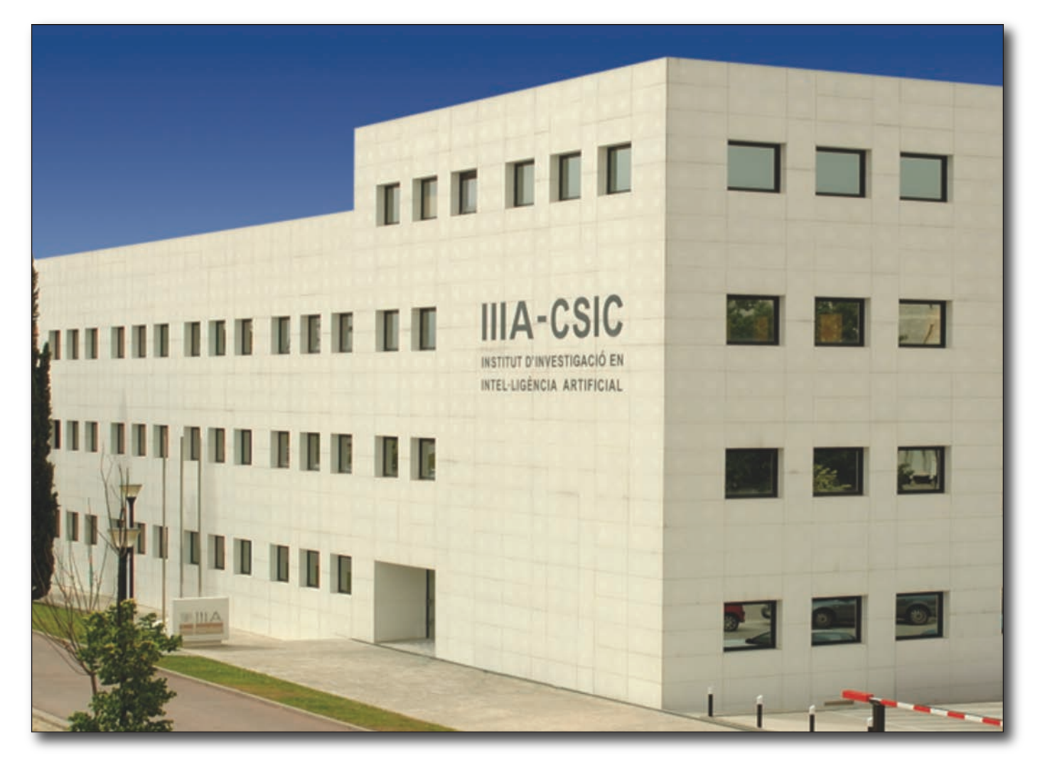
Figure 2. The IIIA Building in the Autonomous University of Barcelona Campus.

job searching; and automatic generation of audiovisual narrative such as summaries of soccer matches or other types of TV broadcast events and news.