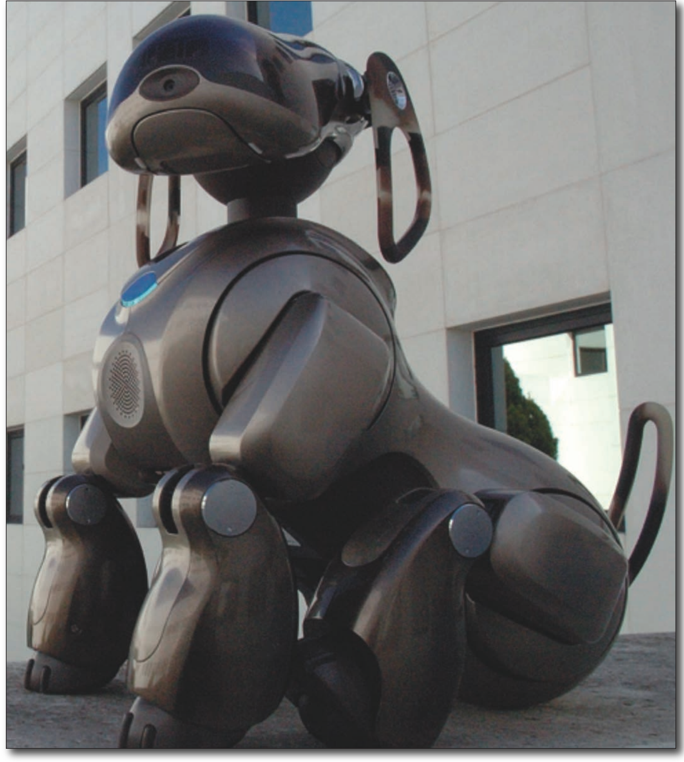
Figure 4. An IIIA Pet in the Courtyard.

els of argumentation with the A-MAIL approach. Moreover, we have developed a formal logic-based model to integrate learning and argumentation (Ontañón et al. 2012).