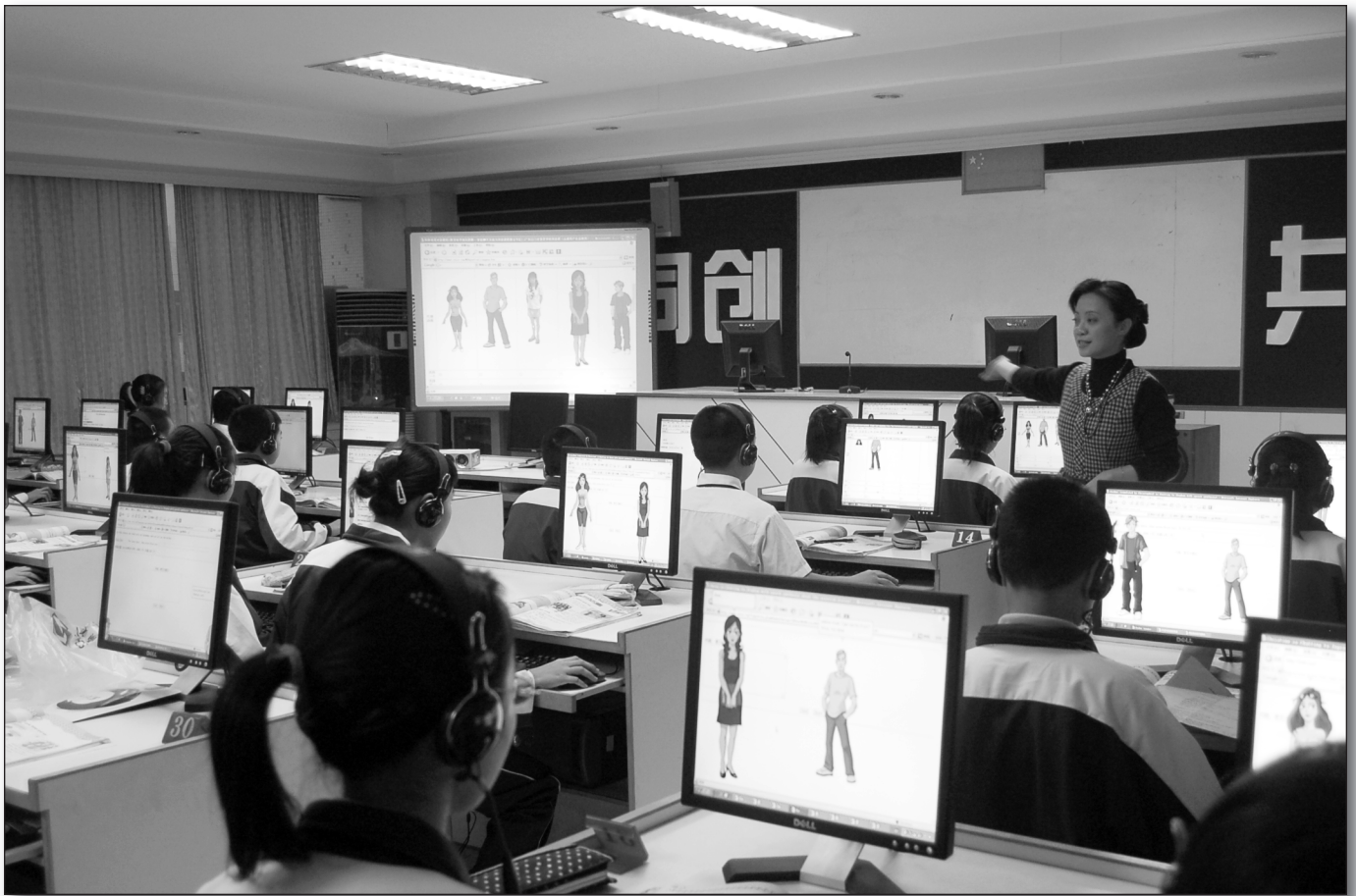
Figure 9. Junior School Students Using CSIEC in the Computer Classroom.

tionnaire. All the items were measured with a five-point Likert agreement scale, that is, 5 indicates the maximum agreement and 1 means no agreement. The Cronbach's Alpha for the five items of the graduate students was 0.933, so reliability of the surveyed items was very good. The Cronbach's Alpha for the six items of the high school students was 0.741. The reliability of the surveyed items here was not as good, but acceptable.