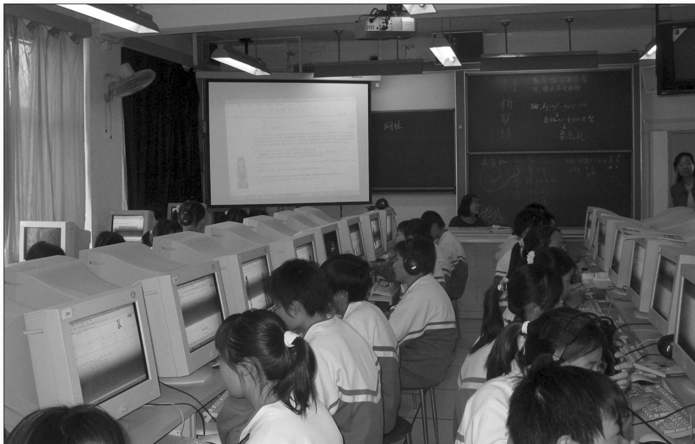
Figure 10. High School Students using CSIEC in the Computer Classroom.