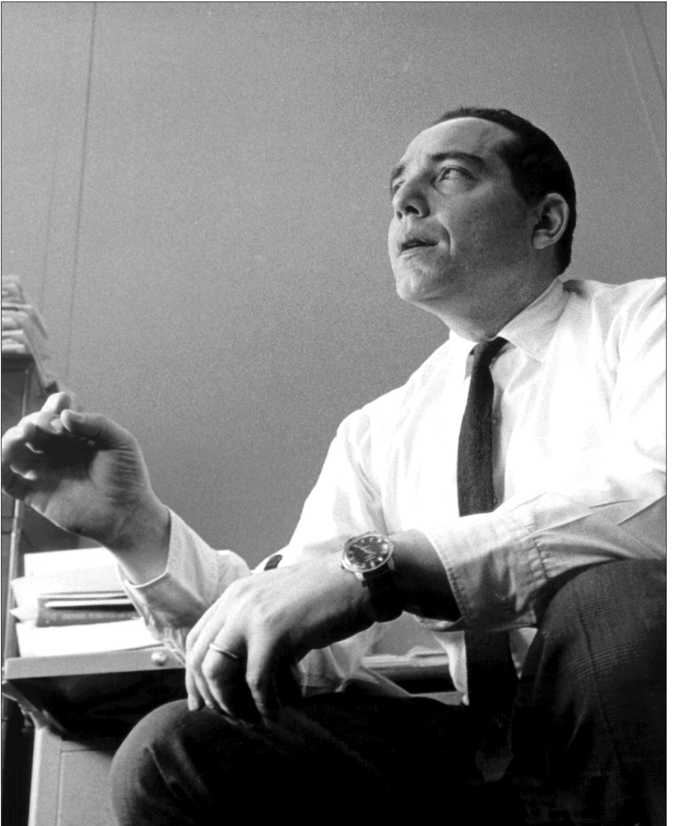
Saul Amarel, February 16, 1928 – December 18, 2002